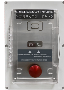
3300S4C (with cover)