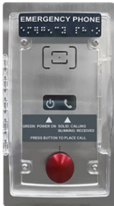
3300FSCN (with cover)