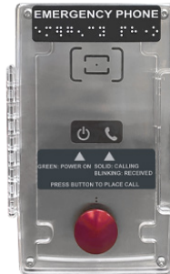
3300SS (with cover)