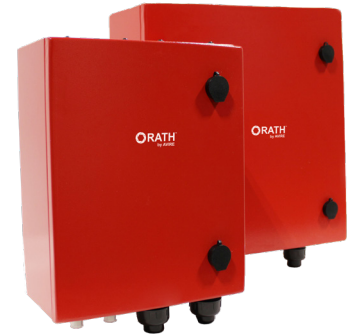
SAFE-1015 and SAFE-1020 units shown above.