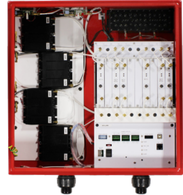
Large size class A UHF 800 configuration shown above.