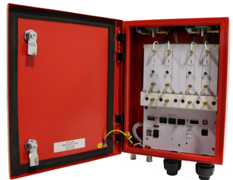
Small size class A VHF interlaced configuration shown above.

WARNING. This is NOT a CONSUMER device. It is designed for installation by FCC LICENSEES and QUALIFIED INSTALLERS. You MUST have an FCC LICENSE or express consent of an FCC Licensee to operate this device. You MUST register Class B signal boosters (as defined in 47 CFR 90.219) online at www.fcc.gov/signal-boosters/registration . Unauthorized use may result in significant forfeiture penalties, including penalties in excess of $100,000 for each continuing violation.