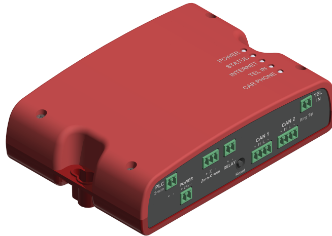
Part #: 7100

The SmartView 2 Machine Room Unit provides the conversion from twisted pair to ethernet and POTS line and power to the SmartView 2 Elevator unit. This is essential to the system for connectivity of audio / video to the outside world and power. The requirement of the system is one SmartView Machine Room unit to one SmartView 2 Elevator unit, without both in a system the SmartView 2 will not function.