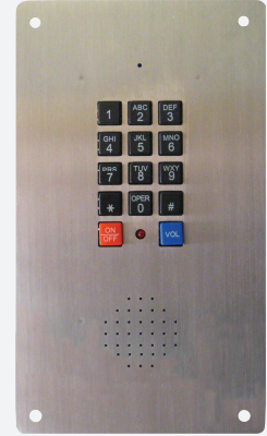
Part #: 2400-878HE Dimensions: 9-1/2" H x 5-1/2" W x 1" D Style: Interior Speaker Phone, Flush Mount, Stainless Steel