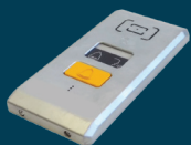
Surface alarm panel

Low Power Bus compatibility extends the power of AAU to complementary equipment for less wiring and smart interconnectivity